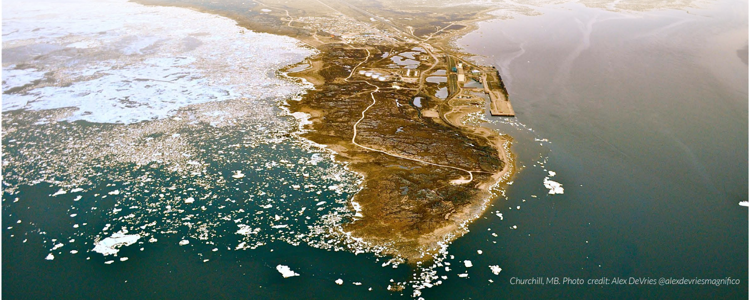
Churchill, MB.